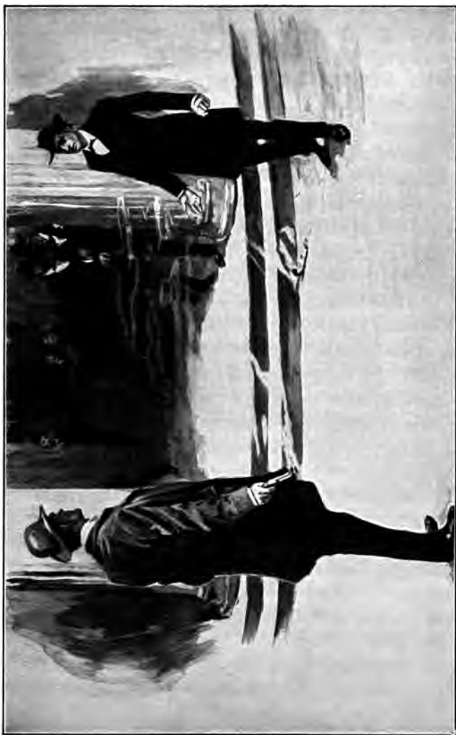
He tossed his weapon aside.